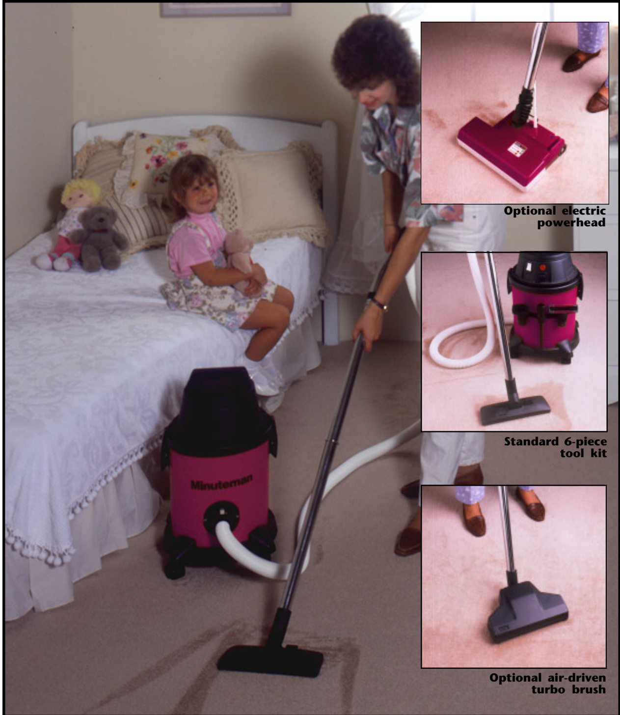
Optional electric powerhead