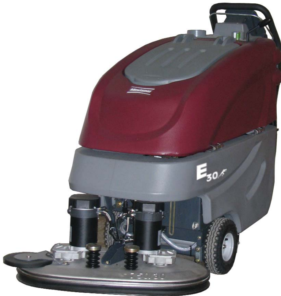
E30 30" Walk-Behind Scrubber