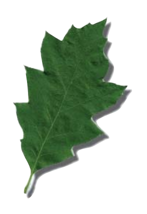
Not Just Clean, It's Green.