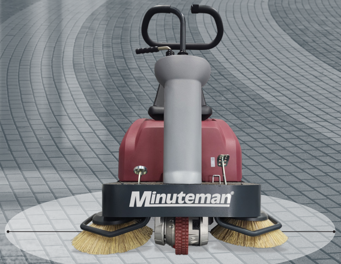
KS32R Rider 43.7" Sweep Path Max