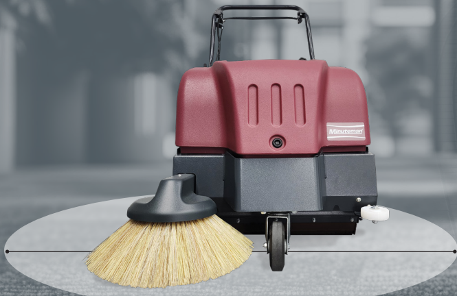
KS28 Walk-Behind 28" Sweep Path Max