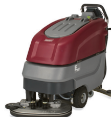
E26 Walk-behind Scrubbers