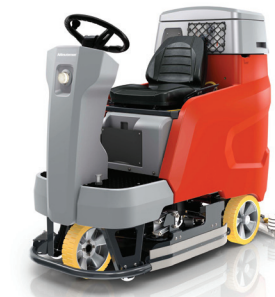
Scrubmaster B120 Rider scrubber