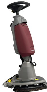
Scrubmaster B5 Small Walk-behind Scrubber