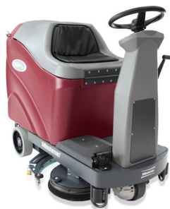
MAX Ride 26 Compact Rider Scrubber

The SPORT technology (Scrub Polish or Remove Top Two Coats) – allows for an easily and economical means to perform chemical free surface preparation and or the removal of floor finish to effectively clean and restore floors.