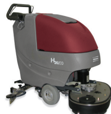
E26 Eco Small Walk-behind Scrubber