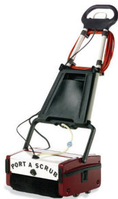
Port a Scrub 12 Micro Walk-behind Scrubber