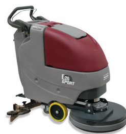
E17, E20, E20 Cylindrical Small Walk-behind Scrubbers