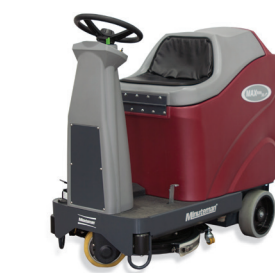
MAX Ride 20 Compact Rider Scrubber