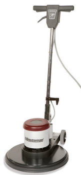
Frontrunner Series Floor Machines