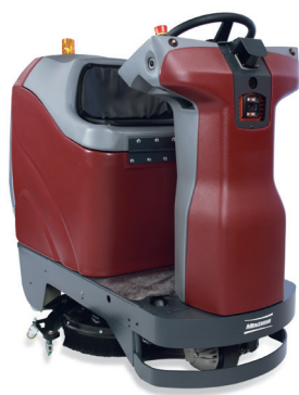
Robo Scrub Autonomous Rider Scrubber