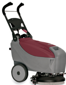
E14 Small Walk-behind Scrubber