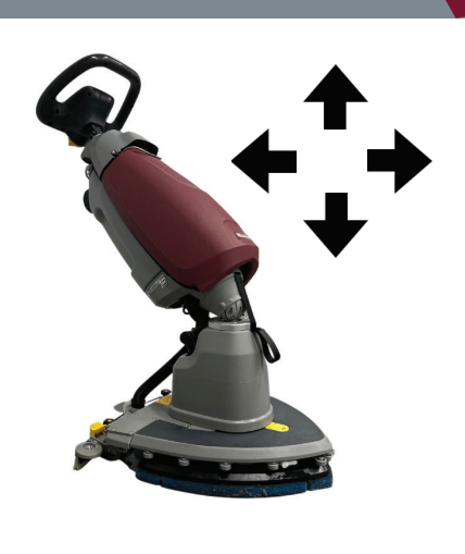
Effortlessly move the operating handle forwards, backwards and sideways.