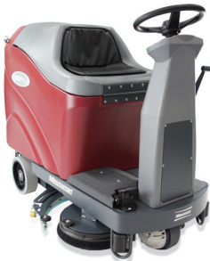
MAX Ride 26 Compact Rider Scrubber