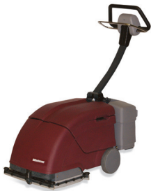
Port a Scrub 14 Micro Walk-behind Scrubber