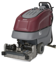
E24 Walk-behind Scrubber