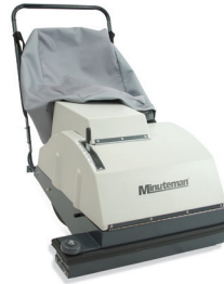
747 30" Wide Area Vacuum