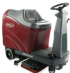
Max Ride 20 Orbital or Max Ride 28 Orbital Compact Orbital Rider Scrubber