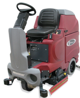
E Ride 32 Rider Scrubber