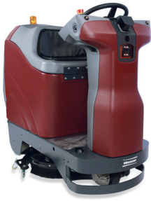
Robo Scrub Autonomous Rider Scrubber