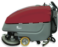
E3030, E3330, E2830 Large Walk-behind Scrubbers