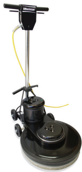
Mirage 1500/2000 Cord-electric Burnishers