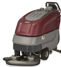
E26, H26, E30ECO Walk-behind Scrubbers