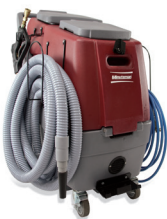
Total Restroom System Restroom Cleaners