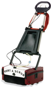
Port a Scrub 12 Micro Walk-behind Scrubber