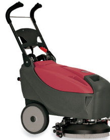
E14 Small Walk-behind Scrubber