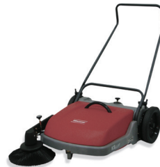
Kleen Sweep 27 Manual Walk-behind Sweeper