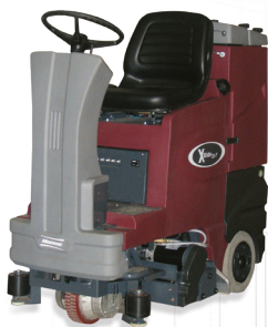
E Ride 26 Compact Rider scrubber

The SPORT technology (Scrub Polish or Remove Top Two Coats) – allows for an easily and economical means to perform chemical free surface preparation and or the removal of floor finish to effectively clean and restore floors.