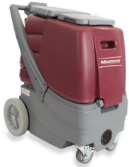
Rush Series Extractor Box extractors