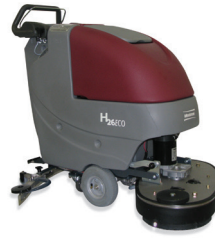
E26 Eco Small Walk-behind Scrubber