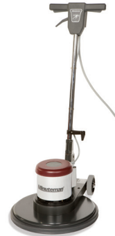
Frontrunner Series Floor Machines