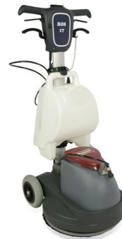
ROS 17 Orbital Floor Machine