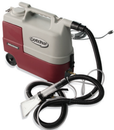
Gotcha! Carpet Spotter