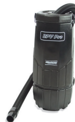
S10 Commercial Back Pack Vacuum