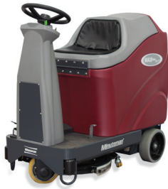
MAX Ride 20 Compact Rider Scrubber