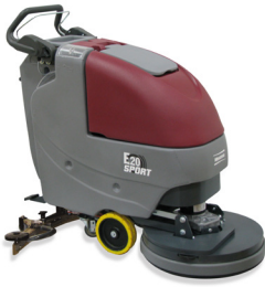
E17, E20, E20 Cylindrical Small Walk-behind Scrubbers