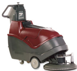
Lumina 20 Battery Burnisher